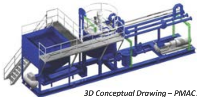
3D Conceptual Drawing – PMAC Skid

ECF's Mechanical Installation Division has the expertise to install this equipment and provide a full system integration including, equipment tie-ins, startups and operational support once installed.